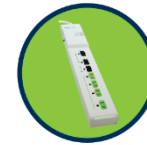
Advanced power strip