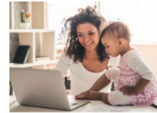
Energy Smart Online Marketplace