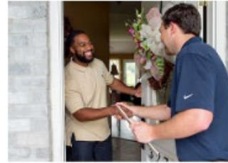
Home Performance with ENERGY STAR®