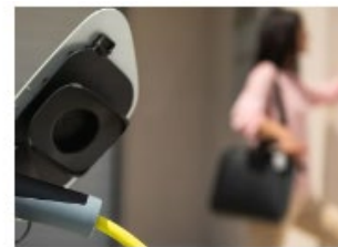
Bring Your Own Charger Pilot