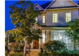
Residential Battery Pilot