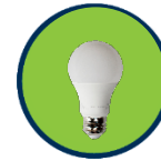
LED light bulbs