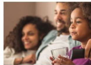
Peak Time Rebate Pilot